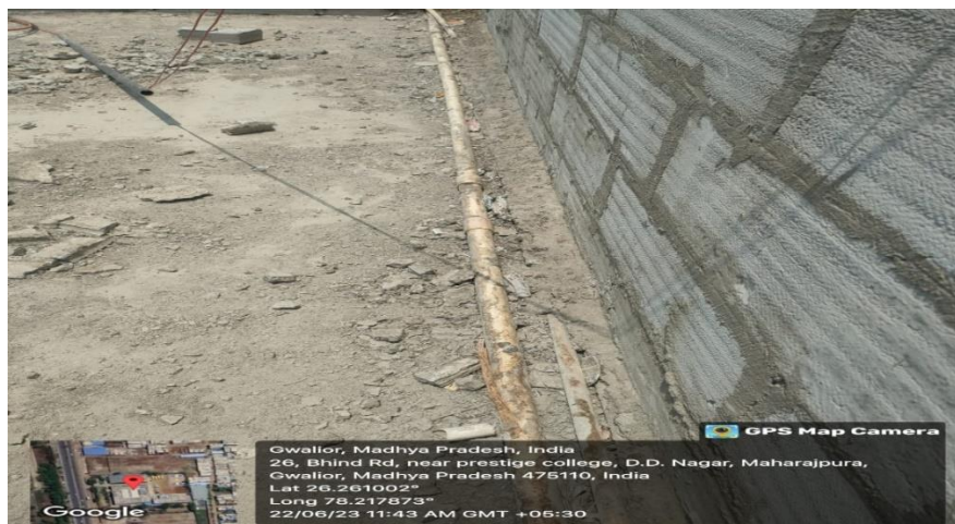
Connecting Pipe System