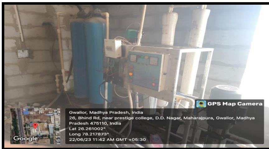
RO Waste Water collection in the Tank for Reuse

The institution's water supply system is well-established and properly installed, ensuring a reliable source of water for all campus facilities. Regular maintenance and monitoring are conducted to maintain optimal performance and compliance with safety standards, contributing to a healthy and sustainable environment for students and staff.