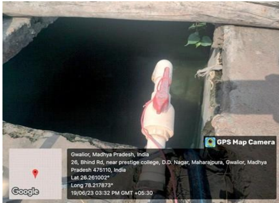
Underground Water tank in front of Block C Ground Area