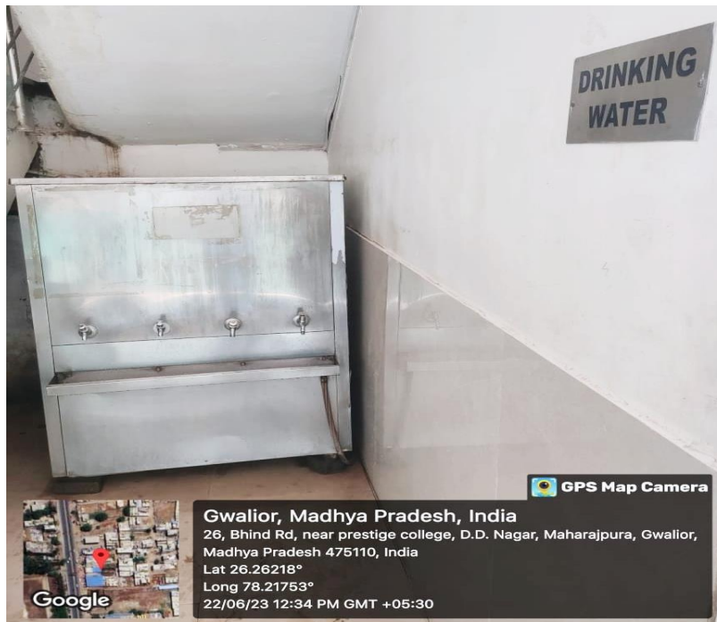
RO Water supply for drinking in Block A