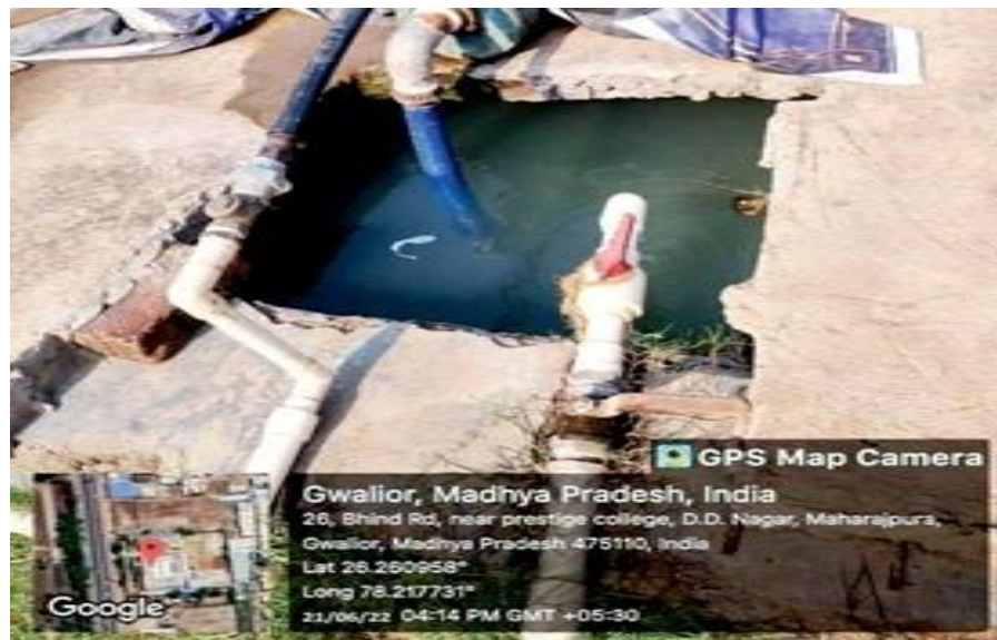
Underground Water tank in front of Block C Ground Area